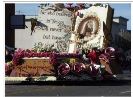
The finished project.